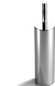
L5044 Freestanding toilet brush