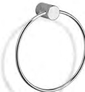
N5098 Towel ring