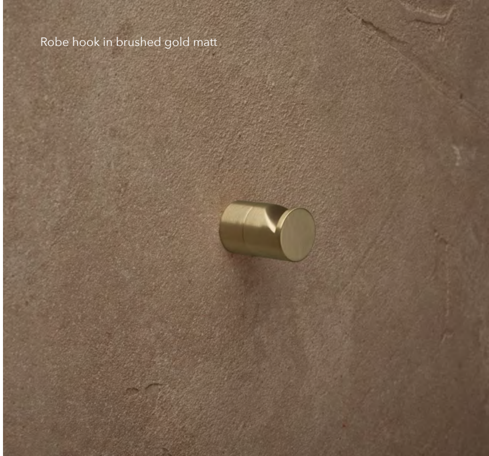
Robe hook in brushed gold matt