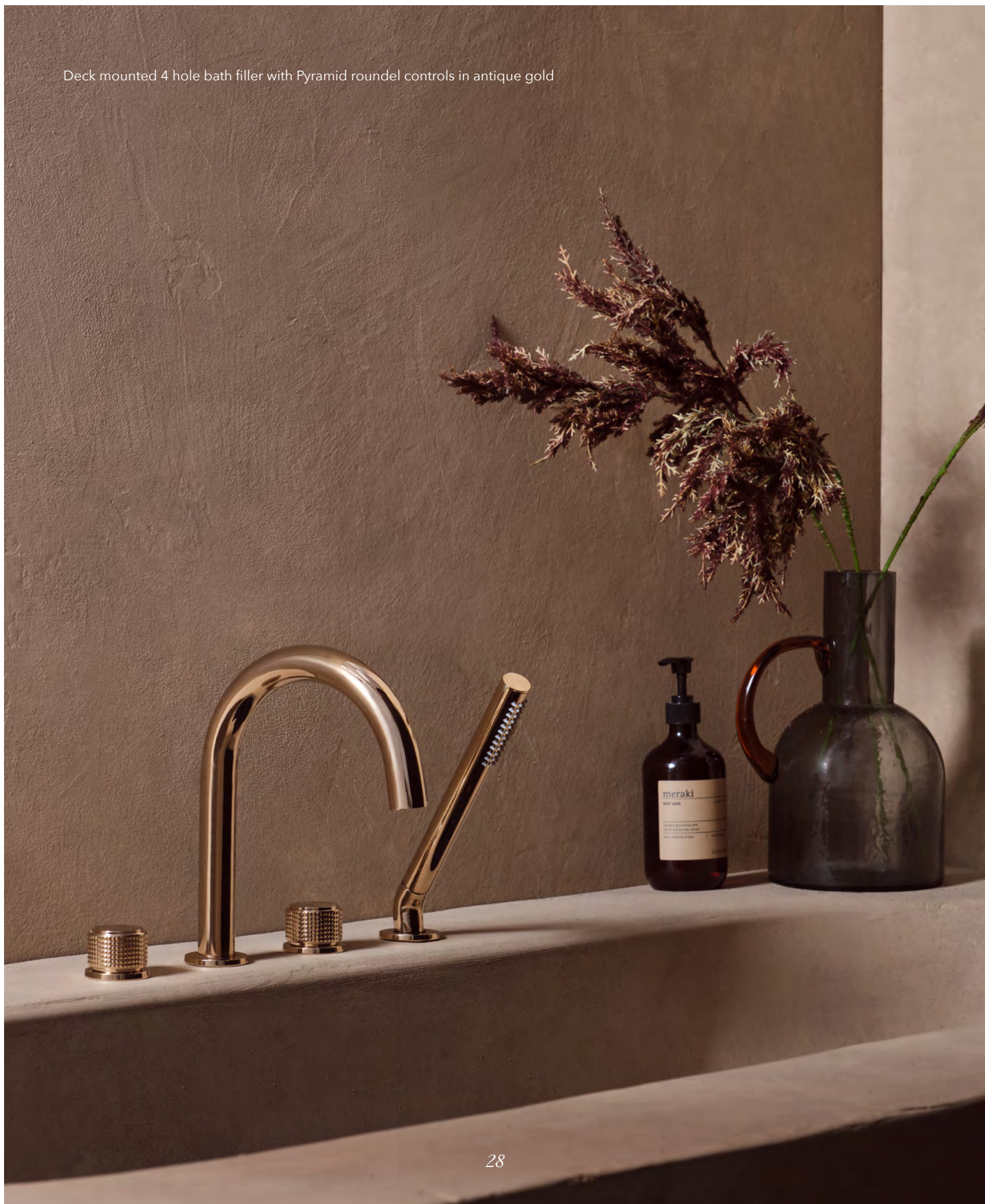
Deck mounted 4 hole bath filler with Pyramid roundel controls in antique gold