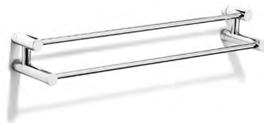
N5301, A Double towel rail