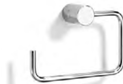
N5037 Paper holder