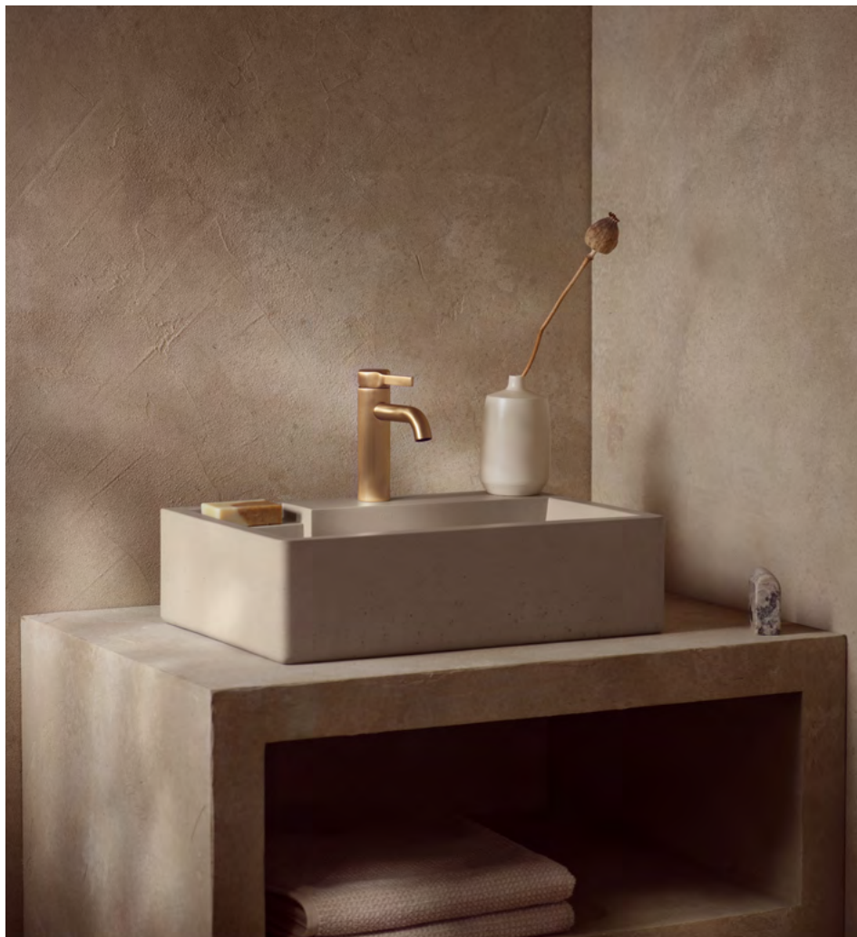
Single lever deck mounted basin tap in brushed gold matt