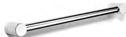
N5139-A, B Grab rail