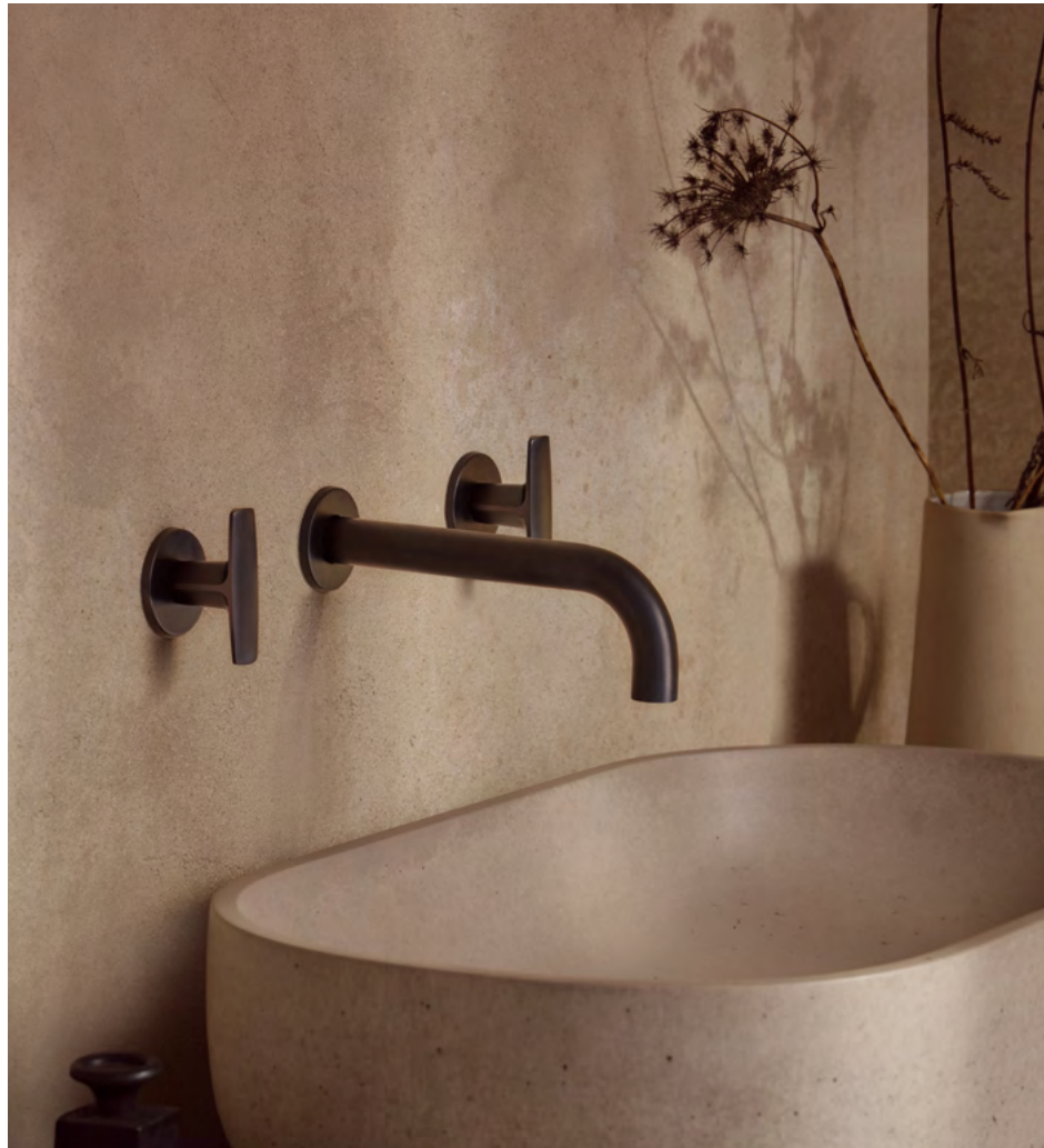
3 hole wall mounted basin tap with T-bar controls in matt black chrome