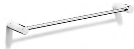
N5137, A, B Towel rail