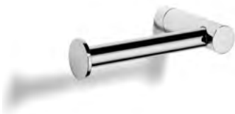
N5091 Single arm paper holder