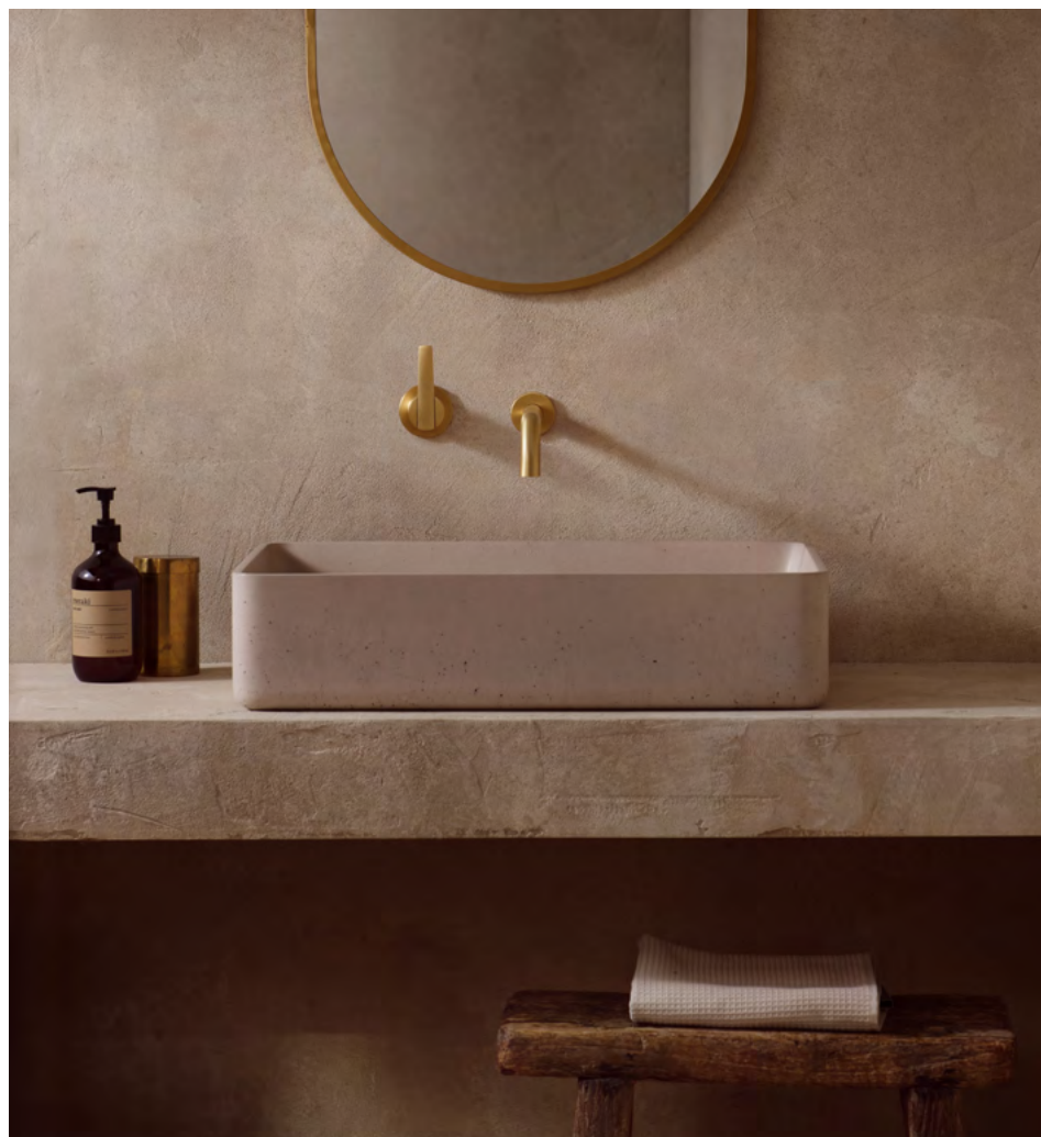
2 hole wall mounted basin tap with Classic lever in brushed gold matt